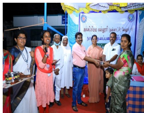
Prize Distribution – Village women