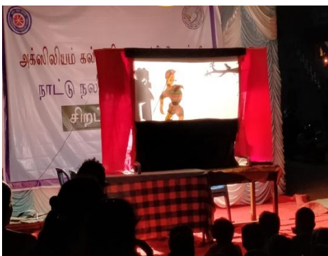
Puppet Show on Girl Children Education