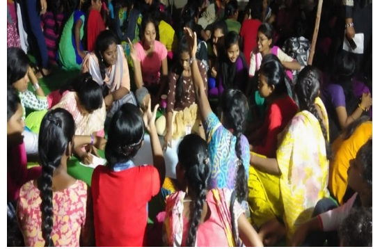
Group Discussion and Village Mapping