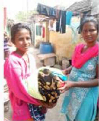
SHARING WITH THE POOR FAMILIES OF SALVANPET