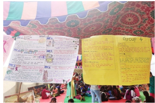
Awareness Song- Practice and Composing