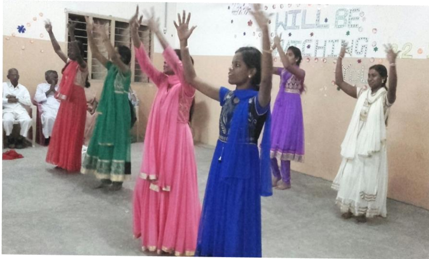
Cultural Programme by VIDES during the Visit of Salesian Provincial at T.K.Puram