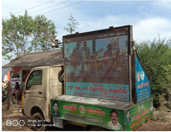
AV on SOS App